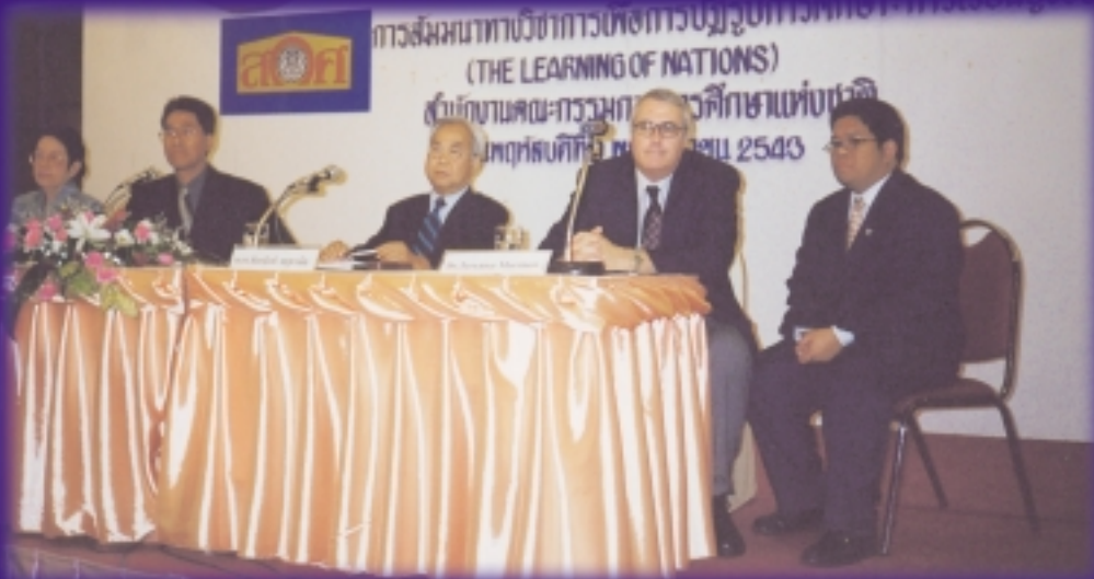
A seminar on “The Learning of Nations” held in Bangkok by ONEC in cooperation with the Asian Development Bank Institute.